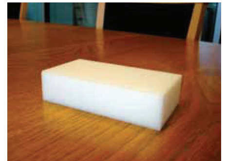
New Magic Eraser