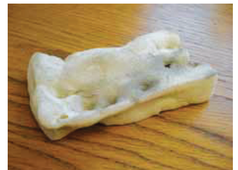
Several Uses - Discard